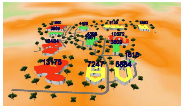
Figure 5. 3D Model using SRTM DTM.

3.2.1 VTP 3D Environment: The generated 3D environment is shown in Fig. 5. Buildings were color-coded according to the range of cooling load: green for 0 to 5,000 kW, yellow for 5,000 to 10,000 kW, and red for >10,000 kW. Additionally, the cooling load values in kW are indicated on top of each building feature.