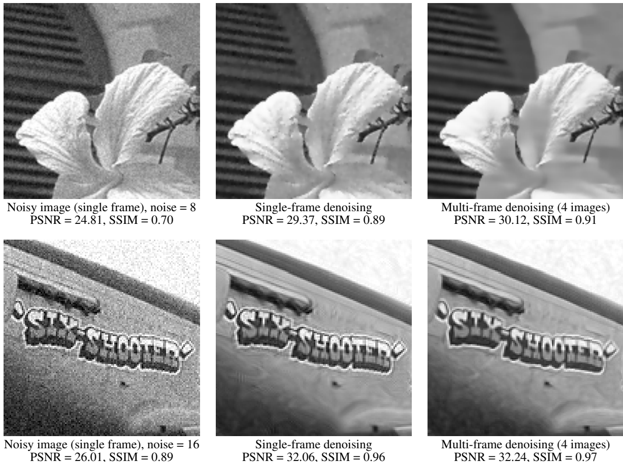
Figure 2. The results of single- and multi-frame image denoising algorithm.

Dong, W., Zhang, L., Shi, G., 2011. Centralized sparse representation for image restoration. 2011 International Conference on Computer Vision , IEEE, 1259–1266.