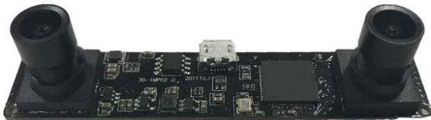
Figure 3. Stereo camera with a photo base of 6 cm and a focal length of 5 mm

Figure 3 shows the stereo camera that was used to implement autonomous robot navigation (Chibunichev A. G., et al, 2019). Table 1 shows its characteristics.