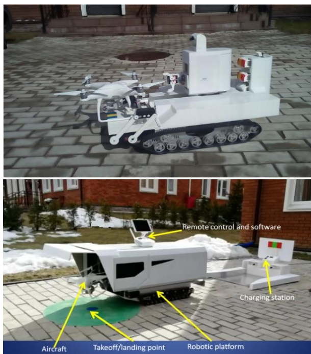
Figure 1. Two versions of the mobile robot

At the photogrammetry department of MIIGAiK is developing an "Automated information generation system" that is designed to perform aerial photography of an object using an unmanned aerial vehicle and obtain documents about the area (orthophoto, DTM, etc.) in automatic mode. A mobile robot is an integral part of this system (Fig. 1) designed to automatically change and charge the battery of the copter.