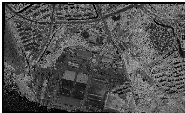
Figure 1. Intensity image of the first dataset

Optech ALTM scanner from the city of Jingmen in China with an area of 1.20 km 2 and 984,998 points cloud data in total. The second dataset (Sample2) was located within the city of Luoding, China, characterized by modern architecture with low and high-storey buildings. Both of these two datasets contain X, Y, Z coordinates and intensity information. Figures 1 and 2 are intensity images of the two areas. It can be found that these two areas contain different terrain features.