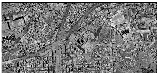
Figure 2. Intensity image of the second dataset

Three indicators namely Type I error, Type II error and Total error are applied for accessing the performance of the proposed method. Type I error is referred to as the percentage of rejecting ground points as object points, while Type II error denotes the percentage of accepting object points as ground points. Total error is the percentage of all the misclassifying points. The three indicators are defined in Equation (5):