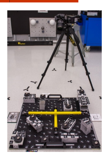
Figure 7: The 3D test object consisted of about 170 coded targets with a largest dimension of 900 mm.

The NORMAL data set was analysed and used as a reference for the processing of the TILTED data set. The TILTED data set was