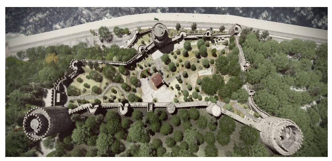
Figure 5. Nadir view of the fortress Rumeli Hisarı generated in Lumion