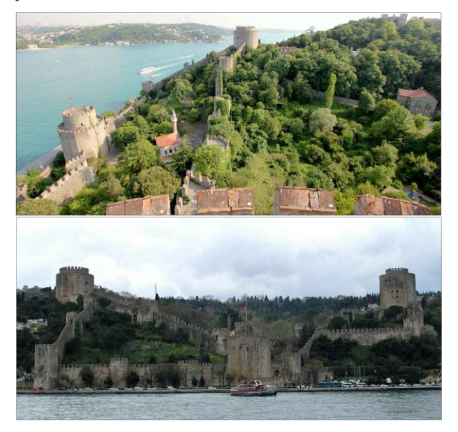
Figure 1. Rumeli Hisarı, the historic Ottoman fortress at the Bosporus in Istanbul, Turkey

Rumeli Hisarı is an Ottoman fortress (Fig. 1), housing a museum, located on the European side of the Bosporus in the Istanbul district Sarıyer opposite the Anadolu Hisarı. Rumeli Hisarı was built in 1452 by Fatih Sultan Mehmed II (the Conqueror) in order to control the passage of the ships entering through the Bosporus, where the strait is only 700 m wide. The geographic location of the fortress is ideal for controlling the Rumeli coast of the waterway as it is located at the narrowest point of the strait.