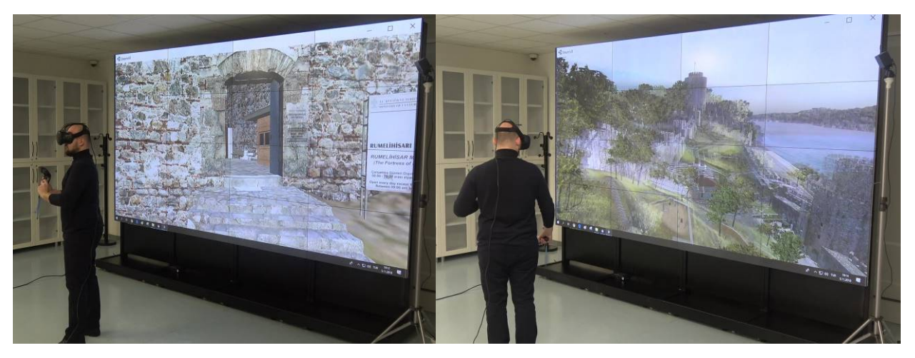
Figure 9. The Virtual Reality System HTC Vive in action using the controllers for navigation and interacting with the environment

The International Archives of the Photogrammetry, Remote Sensing and Spatial Information Sciences, Volume XLII-2/W9, 2019 8th Intl. Workshop 3D-ARCH "3D Virtual Reconstruction and Visualization of Complex Architectures", 6–8 February 2019, Bergamo, Italy