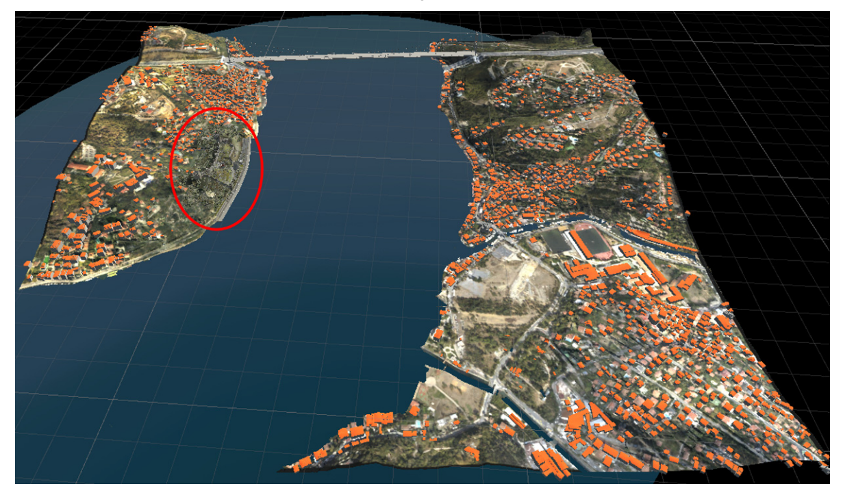
Figure 12. The fortress model (red circle) embedded in the Istanbul 3D city model for better VR visualisation of the environment

Virtual reality utilizing a HMD is a solitary task by definition, because all outside senses are dampened to enhance the immersion and, therefore, the experience. To create a more social experience, multiple users can join the experience to explore the virtual object together as avatars while each user is at a different real world location using a HMD. The independent networking solution Photon (Photon Unity Networking) is used to implement the synchronisation of multiuser movements. Voice is acquired through the included microphone in the HMD and played back for all users with respect to the speaker's position (spatialized audio). Photon also provides the server infrastructure and is free to use for a moderate user count.