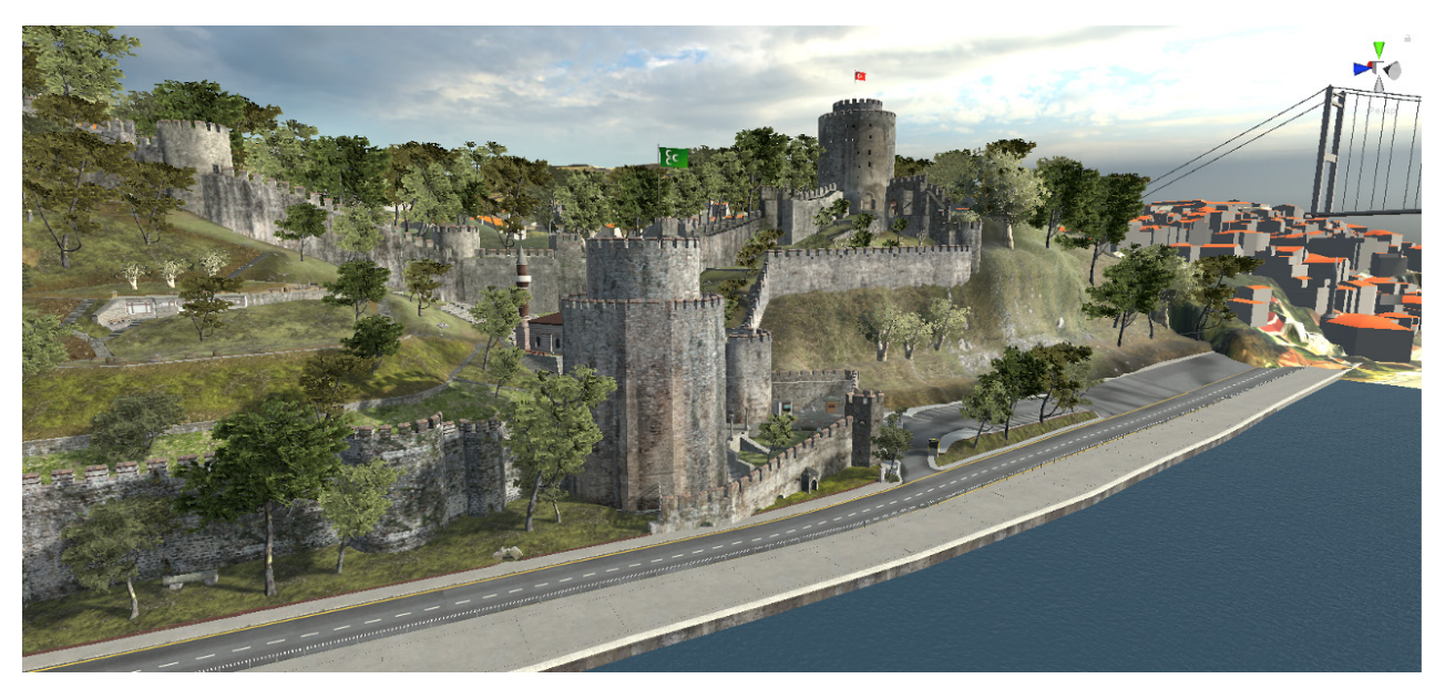
Figure 11. Perspective view of the fortress in the VR application (Unity) with the 3D city model of Istanbul in the right background

The International Archives of the Photogrammetry, Remote Sensing and Spatial Information Sciences, Volume XLII-2/W9, 2019 8th Intl. Workshop 3D-ARCH "3D Virtual Reconstruction and Visualization of Complex Architectures", 6–8 February 2019, Bergamo, Italy