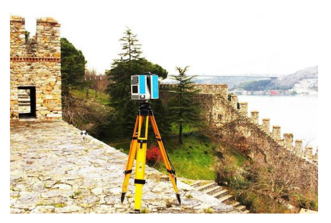
Figure 2. The terrestrial laser scanning system Z+F IMAGER 5010 at the fortress Rumeli Hisarı

The following workflow has been carried out to generate a detailed virtual 3D model of the complete fortress: (1) data acquisition using terrestrial laser scanning with three Zoller + Fröhlich IMAGER scanner, (2) Registration and georeferencing of scans using LaserControl, (3) segmentation of point clouds in tiles in LaserControl, (4) re-organisation of point cloud tiles in ReCap as preparation for modelling in 3ds Max, (5) 3D solid modelling with 3ds Max using segmented point clouds, (6) texture mapping of polygon models with 3ds Max, (7) data conversion for the import into the game engine Unity, (8) composition of the highly detailed model into the surrounding DEM and 3D city model, (9) development of motion control and interactions in Unity, (10) implementation into the HTC Vive, and (11) immersive and interactive visualisation of the fortress in the VR system HTC Vive using Steam VR as an interface between game engine and HTC Vive.