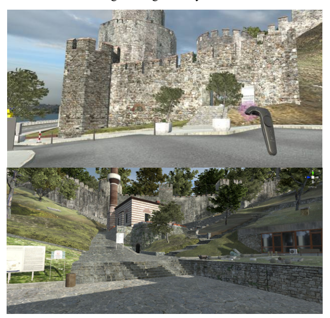
Figure 10. Outside of the fortress in the VR application (Unity) with the controller (top) and perspective view of the fortress inside (bottom)

scheme was utilized that is only limited to the ground plane of the fortress and the close surrounding. The movement feature was implemented using the SteamVR package from the Unity asset store. Fig. 10 and 11 illustrated the implementation of the fortress model in the game engine unity.