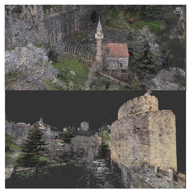
Figure 3. Parts of the coloured point cloud of Rumeli Hisarı

for a sufficient performance of the VR application in the game engine Unity.