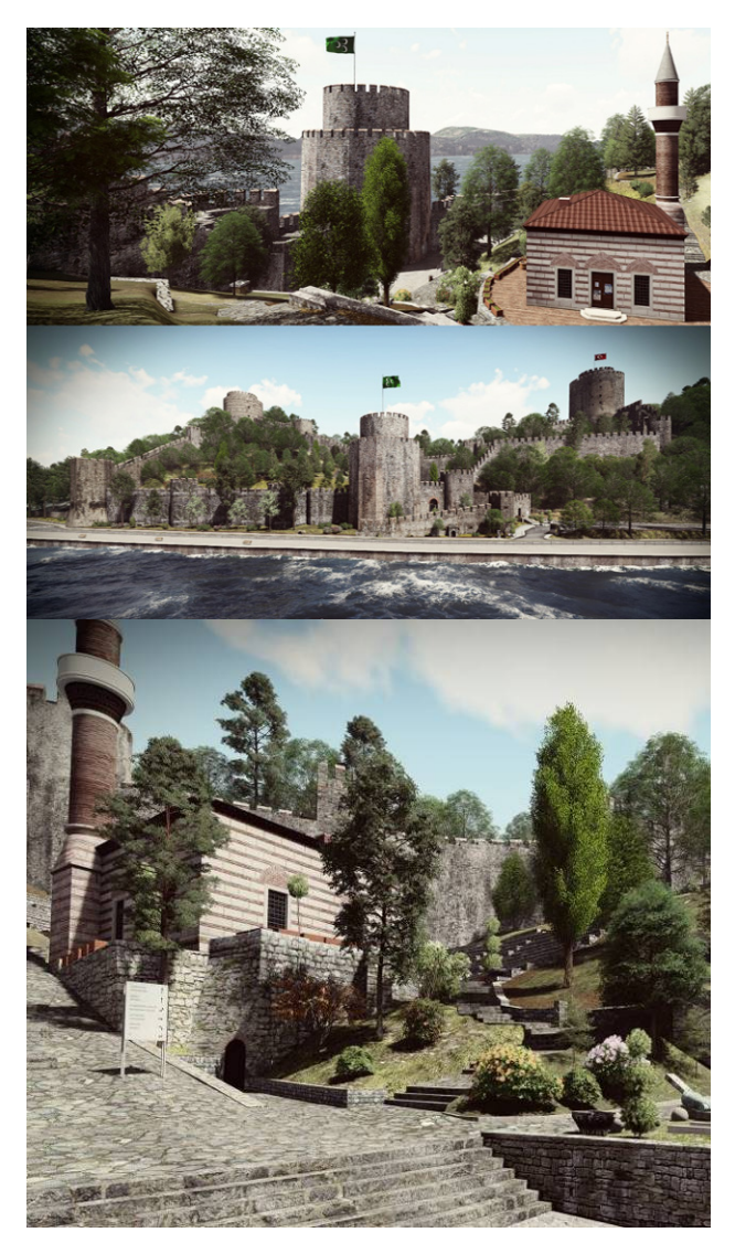
Figure 6. Perspective views of the fortress Rumeli Hisari generated in Lumion