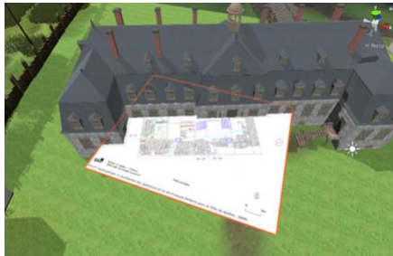
Figure 3. Archaeological excavation survey of 2009, which located the foundations of the staircase, inside the 3D virtual environment.

In this immersive environment that we created, the archaeologist was able to integrate archaeological excavations, surveys, historical maps and architectural plans related to the period of study (Figure 3).