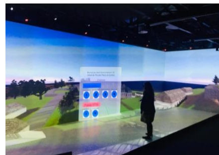
Figure 2. Test of the 3D model of the Intendance's palace in an immersive room.

Next, we added the elements directly into the virtual software Unity and chose the materials/textures for each of them. Aiming for an efficient yet realistic context, the computer researchers integrated a skybox to allow a change from day to night and back again. For navigation, the "ghost" mode was preferred, as it gives more possibilities of movement for the user to go in any direction without gravity. A main menu was created to explain the project and the controls and to allow the user to choose between an Edition mode (tr. edit mode) and a visualization mode of the initial hypothesis (Figure 2).