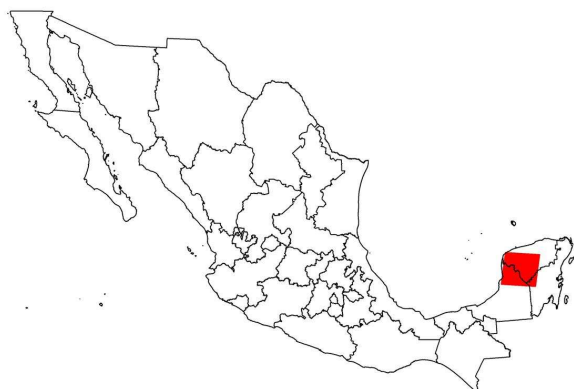
Figure 1. Study areas: the national terrestrial territory of Mexico with its states and location of Landsat path-row 046-020 on the Yucatan peninsula, marked in red.

In a first test, the national terrestrial territory of Mexico (1.972 Mio km 2 ) will be analyzed using MODIS data. Next, the area of path-row 046-020 will be studied in detail (Figure 1) using Landsat and MODIS-based change detection products. This region, located in the north-western portion of the Yucatan peninsula and south of the city of Merida, depicts a transition from deciduous to evergreen broadleaf tropical forests towards the East. Slash-and-burn agriculture, such as frequently applied to Milpas , is characteristic to fertilize poor karstic soils for a short period of 3-5 years, planting maize, squash, and beans.