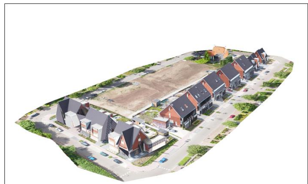
Figure 6: Textured 3D model created with elevation model and measured roof lines

Orbit GIS also took care of the processing with an ortho-photo as result. Post-processing was started by importing the gathered data in Orbit software. Operators started with automatic step- and model creation, followed by auto-detection of points and matching images with the so called "Von Gruber" matching method. After Bundle Block Adjustment (BBA) the images were stitched geometrically and oriented correctly to each other. A Digital Terrain Model could be build and based on this an ortho-photo was created, see also Figure-6. The average geometrical accuracy of all photos was 3 centimetres maximum! Because of the overlap of 80% it is also possible to create stereo-photos; on a screen it is possible to show the pictures in 3D.