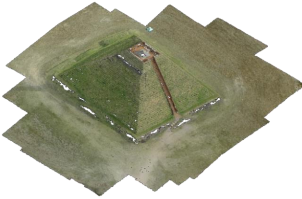
Figure-4: Computed 3D pointcloud of the Pyramid