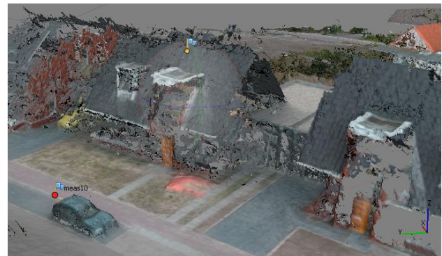
Figure 12: Artefacts in the 3D correlation process.

The best quality ortho-mosaic is obtained by Orbit GIS, because with this software the 3D terrain model first was converted to a 3D elevation model of the ground level after which 3D roof lines of the buildings were added manually.