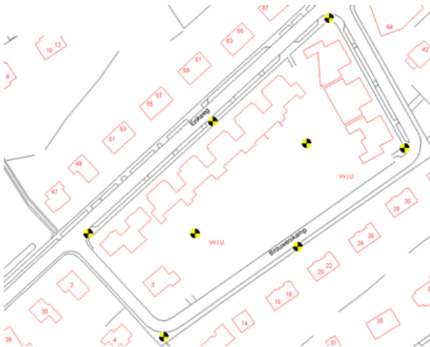
Figure-5: Overview of Nunspeet test area with locations of the ground control points

The second experiment was conducted in Nunspeet on 29 March 2012. It concerned a real cadastral situation in which the parcel boundaries of 20 new houses had been identified and measured, see Figure-5.