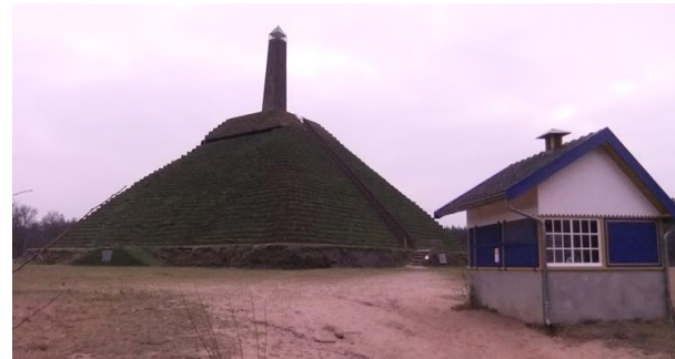
Figure 2: Pyramid of Austerlitz, January 2012.

The first experiment was carried out 18 January 2012, at the Pyramid of Austerlitz, a flat sandy area surrounded by forest with a 30m high pyramid, built as victory monument by troops of Napoleon, see Figure-2. This concerned a learning phase aimed at getting acquainted with the technology.