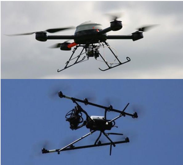
Figure 7: The Microdrone MD-4 1000 (up) and AscTec Falcon 8 (down)

The Microdrone MD-4 1000 Beta is a quadcopter (four rotors), can carry a payload of 1,200g and can stay in the air for up to 45 minutes. Navigation and positioning is done using GNSS.