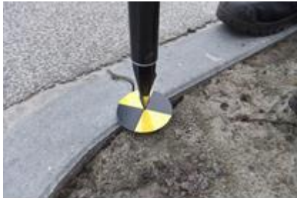
Figure 10: Professional ground marker for geometrical corrections

Thirdly, the used UAS delivered the GPS positions of the camera at the moment that a picture was taken. These could be made available for the processing software.