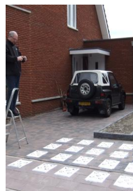
Figure 9: Procedure of the calibration of the camera

The camera calibration parameters were used in the 3D reconstruction software. For PhotoModeler Scanner this resulted in enhanced accuracy. For PhotoScan Professional it was found that more accurate results were obtained when the camera calibration values were computed by the software during the alignment procedure.