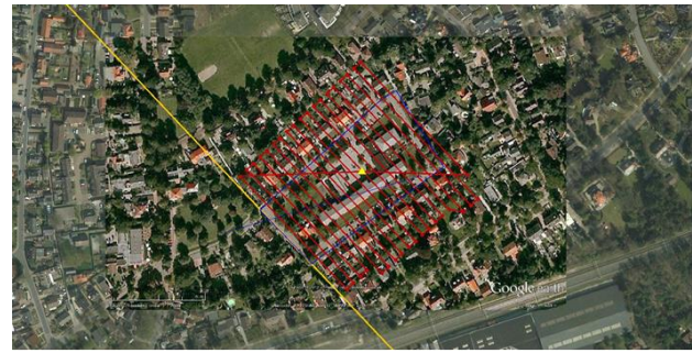
Figure 8: Flightplan second flight Nunspeet by Orbit GIS

Both for the Falcon and Microdrone special mission planning software was available that could generate a mission plan for autonomous flying a grid of positions where photographs are captured, such that a specified area of interest is covered with photos with required overlap and resolution, see also Figure-8. Based on the test flights for the Falcon it was specified to firstly wait some second at each position before taking the photo, so that maximal stability of the system was obtained. An important aspect also was to take a wide enough zone around the area of interest, so that the full area was covered with photos with enough overlap and also control points on the edges of the area are captured in enough photos.