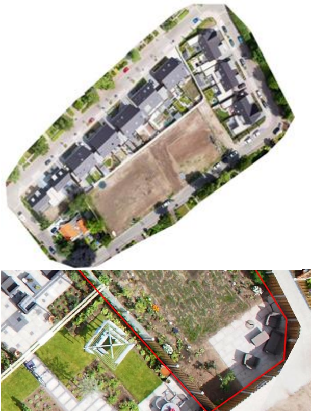
Figure 13: Orthophoto Nunspeet and zoomed-in orthophoto with cadastral borders (in red).

The results obtained by Orbit GIS give were even better, for the ground control points a standard deviation of 1 to 2 cm was found and for the measurements in the ortho-mosaic errors in the order of 2 to 3 cm were obtained. See Figure-13