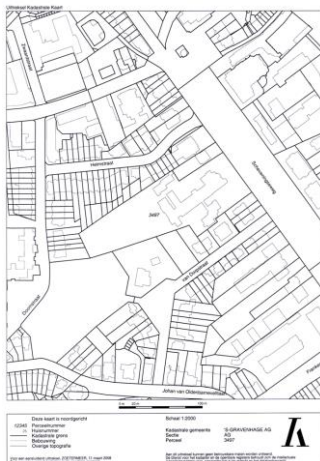
Figure 1: Cadastral map with verified borders

In the Netherlands Kadaster is the national land registration service and mapping agency. Kadaster is responsible for maintaining an actual and complete registration of deeds of ownership, cadastral maps and the juridical borders of real estate, see also Figure-1. Kadaster needs to inform those who are part of the transactions about the current situation.