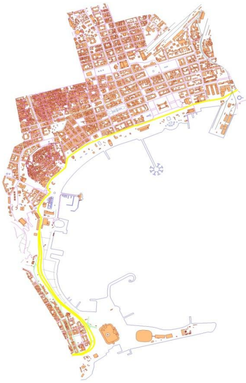
Figure 3. The selection of clutter classes.