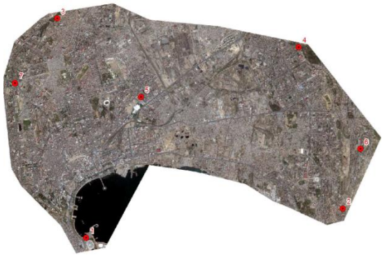
Figure 1. The placement scheme of GPS points

There is shown the placement scheme of GPS points concerning Baku city project in the figure 1.