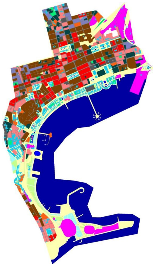
Figure 5. Clutter map scheme in Baku city